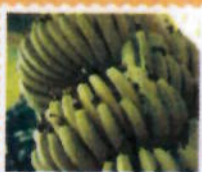
Banana (Matooke): Uganda produces the third largest amounts of bananas worldwide.