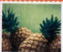
Pineapple is one of the most common fruits in Uganda.