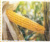
Maize is the most common staple food in Uganda.

I am in Primary Nursery Middle Date 06/12/2016