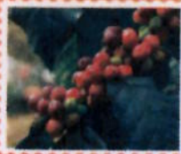
Coffee is one of Uganda's main exports.