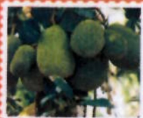
Jack Fruit: Most children in Uganda like eating jack fruit.